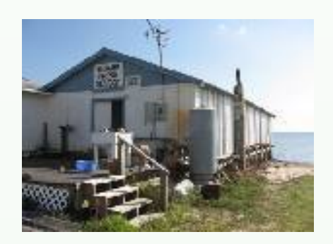
Harkers Island Yeoman's Seafood House

Findings so far are mainly related to Harkers Island, located in the immediate vicinity of park headquarters. A vibrant fishing community for much of the 20th century, since 2006 the site no longer supports any fishing-related activities. Curiously, Harkers Island has eight churches— quite a few for a small