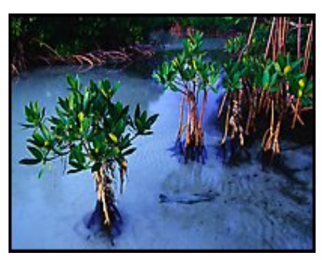
Mangroves at Risk

iscayne Bay extends nearly the entire length of Miami-Dade County, boasting an exotic combination of emerald islands, fish abundant coral reefs, green parklands, and dense mangrove. A real sanctuary of biological communities, it is home to endangered species such as the Florida panther and the American alligator and a fauna of at least 512 fish and more than 800 invertebrate species.